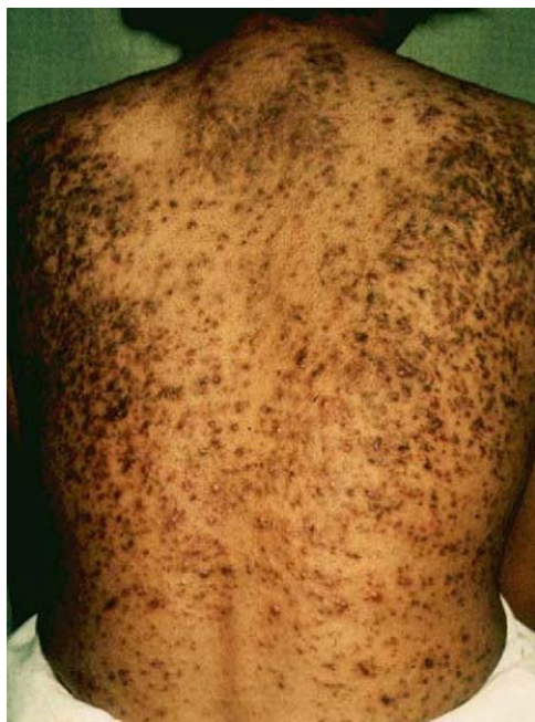
Fig. 4. Chloracne on the back of a Yusho patient.