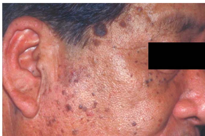
Fig. 6. Chloracne and hyperpigmentation on the face of a Japanese incinerator worker.

present little on this subject and are usually written by authors not very familiar with clinical aspects of these compounds (Kasper et al., 2004). Clinicians may recognize high-dose responses to dioxins, especially with the presence of chloracne as seen in the relatively rapid identification of dioxin poisoning of Ukrainian President Viktor Yushchenko. Low-dose exposure will not be as noticeable clinically, but can be clinically diagnosed with certainty only following laboratory measurements documenting levels increased above background.